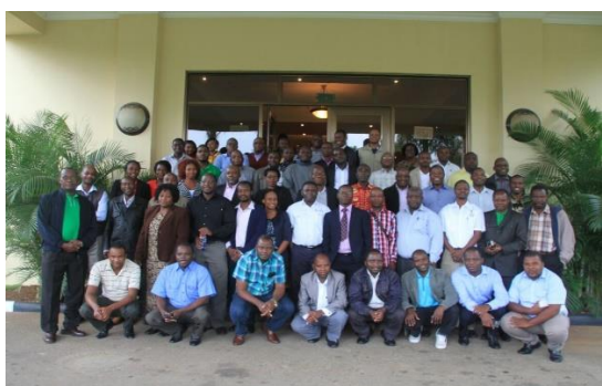
Maize and Multiple crops group in Lusaka, Zambia

The meetings reviewed project implementation progress in the three countries and updated/finalised the R&D project documents (proposal, research protocol, technology dissemination action plan, workplan, budget, logframe and result framework, safeguards checklists) in preparation for 2016/17 cropping season. In addition, there were discussions around emerging research issues for the particular commodity; ideas for improving quality of science; plans for ensuring availability of quality seed; plans for strengthening partnerships; ensuring sustainability; capacity building needs; monitoring plans and schedules for exchange visits.