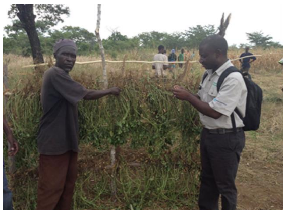
Side raised windrow

(iii) raised ventilated platform. Analysis of the samples from the different drying techniques using the high pressure liquid chromatography (HPLC) validated effectiveness of the techniques in reducing Aflatoxin levels. The project also explored processing of Bambara flour using home utensils. The study on natural occurrence of aflatoxin and bio deterioration of dried cowpeas and pigeon in Malawi showed that floating and washing reduces aflatoxin contamination in grain legumes. The findings highlighted the need to investigate the presence of mycotoxins in all the grain legumes, and also regularly monitor the aflatoxin levels.