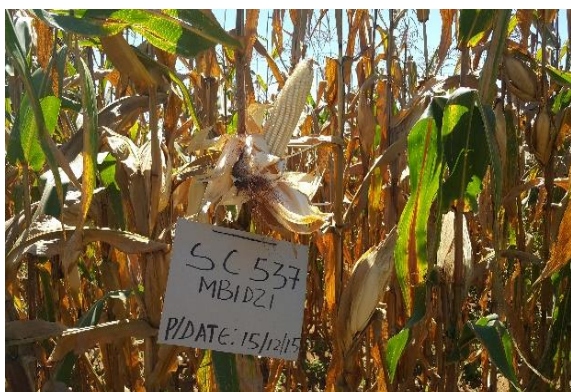
Promising variety under dissemination of improved maize variety project in Malawi.