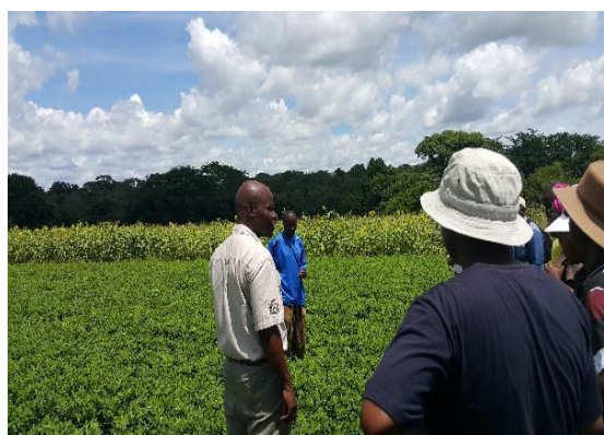
On-farm seed production plot in Zambia

Under the strengthening legume seed delivery project, the three countries produced 21.2Mt of basic seed, 1.2Mt of breeders' seed and 362Mt of certified seed. About 420 seed growers and 50 extension officers were trained on seed production and crop inspection respectively. In addition, the project has advanced a business model for certified seed conveyance comprising of 348 farmers in partnership with upcoming seed companies and seed associations.