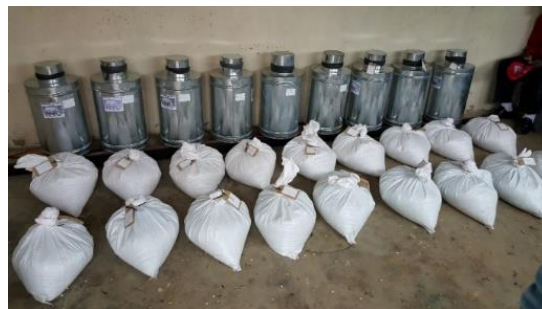
Trial on use of different storage containers in Mozambique