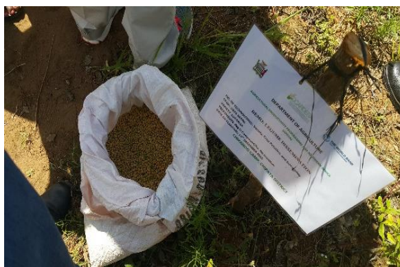
Soya bean under the dissemination of food legume based technologies project in Zambia.