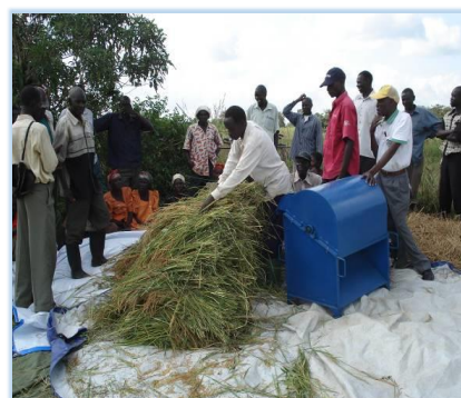
Processing rice using a sheller