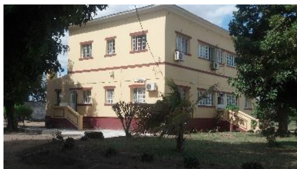
Rehabilitated Chokwe offices in Mozambique.

In Zambia, APPSA in collaboration with E-Government designed ToRs to facilitate design, installation and maintenance of internet network system for 11 research stations [Copperbelt, GART, Kabwe, Mansa, Misamfu, Mochipapa, Mongu, Mt Makulu, Mutanda and Nanga]. Ten land cruisers and three buses were procured, and are awaiting delivery. Preparatory work for the design and supervision of roadworks for three stations [Kabwe, Msekera, Misamfu], and for rehabilitation of Mochipapa and Mt Makulu dams is in progress.