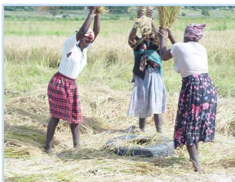
Manual processing of rice

Post-harvest technologies that are not labour intensive e.g. simple rice shellers were developed and promoted.