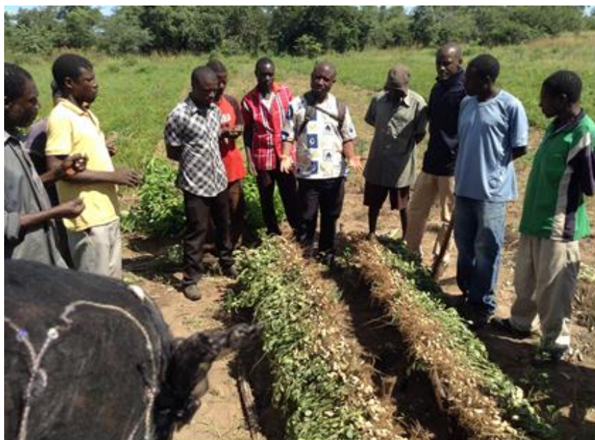
Farmer training on dwarf raised windrow drying technology in Zambia

Traditional drying and curing methods were reviewed and adapted in an effort to reduce aflatoxin contamination, thereby enhancing utilization and marketability of groundnuts and bambara nuts. Fifty nine farmers were trained, and took part in the preparation of improved drying technologies which are (i) side raised windrow, (ii) dwarf raised windrow and