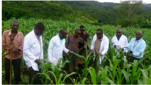
MLN disease vector survey in Malawi