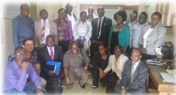
APPSA and EAAPP team members with senior Department of Livestock officials

In an endeavour to facilitate exchange of information and lesson learning, CCARDESA facilitated a 6-day study tour for a 14-member team (APPSA National Coordinators, Directors of Research and key project staff in the APPSA implementing countries) to travel to Kenya on 14 February. The focus areas for the study were on programme implementation, infrastructure development, reforming the National Agricultural Research Systems, the science and technology dissemination agenda for KARLO. The team visited strategic programmes and institutions such as East Africa Agricultural Productivity Program (EAAPP), Kenya Agricultural and Livestock Research Organization (KALRO), Kenya Plant Health Inspectorate Services (KEPHIS),