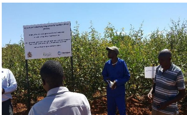
Pigeon pea field day in Mchinji, Malawi

In an effort to promote production of pigeon pea, a less widely grown legume in the three countries, awareness of the crop was created through production and distribution of a guide on Pigeon pea production in English and in Portuguese. Demonstrations were established on farmers' fields and field days conducted. Short- and medium-duration genotypes with fusarium wilt resistance were evaluated for yield potential and adaptability, and the good performing genotypes were selected for further evaluation in advanced variety trials both on-station and on-farm.