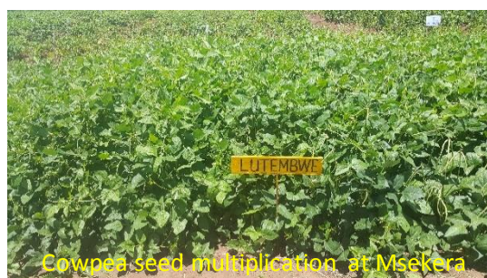
Cowpea seed multiplication at Msekera