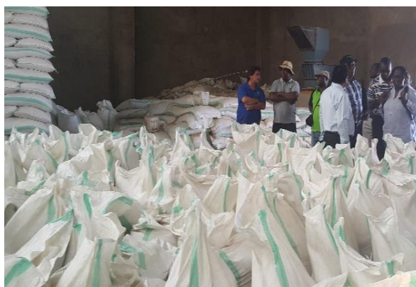
ISM team visit to Sunseed oil producing company in Malawi