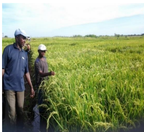
Seed multiplication of improved varieties in Mozambique germplasm

Seed growers were trained, and engaged in seed multiplication of improved varieties that were selected by farmers through participatory variety selection. In Zambia, 420MT of certified seed were produced, while Malawi produced 0.35 MT and Mozambique produced 257MT. In addition, 187 MT of basic seed (Supa and Kilombero varieties) was also produced in Zambia, while Malawi and Mozambique produced 3 MT and 207 MT, respectively. A total of 12 MT of breeders seed was produced by Malawi (1 MT) and Mozambique (11 MT). In Mozambique, the project worked with FAO