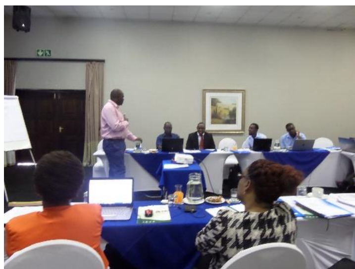
Joint Communication and M&E WG Communication Strategy writeshop in February 2016

In order to elicit ownership of the project communication strategy, CCARDESA convened a writeshop from 1 to 5 February with communication focal points from the APPSA implementing countries to draft a regional Communication Strategy. The strategy that was produced is designed to provide a structured framework for both internal and external communications for the project. It also highlights a number of key interlocutors who are important target audiences or stakeholders for APPSA while also defining the tools which the project will employ to engage them. The draft was circulated to the countries for further review, following which a communication implementation plan will be finalised and implemented. A summary of what the Communication Strategy entails was presented during the Implementation Support Mission in November 2016.