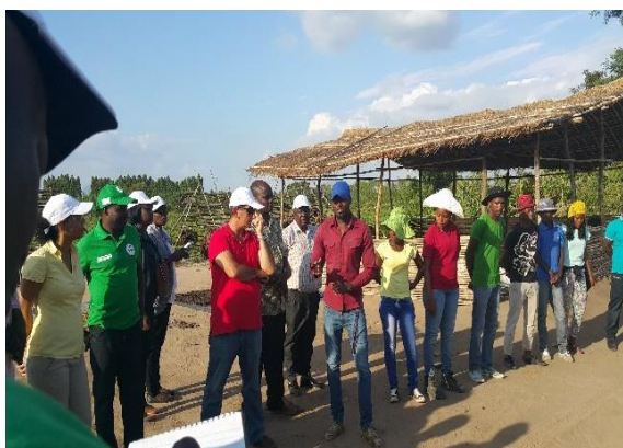
ISM team field visit in Nampula

Annually, two joint Government/CCARDESA/World Bank Implementation support Missions are undertaken to assess progress in implementation of project activities. The missions were undertaken to review the project implementation status and assess whether activities are proceeding as planned. The first Implementation Support Mission for 2016 was undertaken in April and started in Zambia through Malawi and concluded in Mozambique with a regional wrap up meeting in Nampula. The second mission was undertaken in November and commenced in Mozambique through Zambia and ended in Malawi with a regional wrap meeting in Lilongwe. During this process, the missions held detailed discussions with a range of stakeholders within each of the three implementing agencies, as well as staff of the respective Ministries of Agriculture and other project stakeholders, who were also invited to attend the wrap-up meetings.