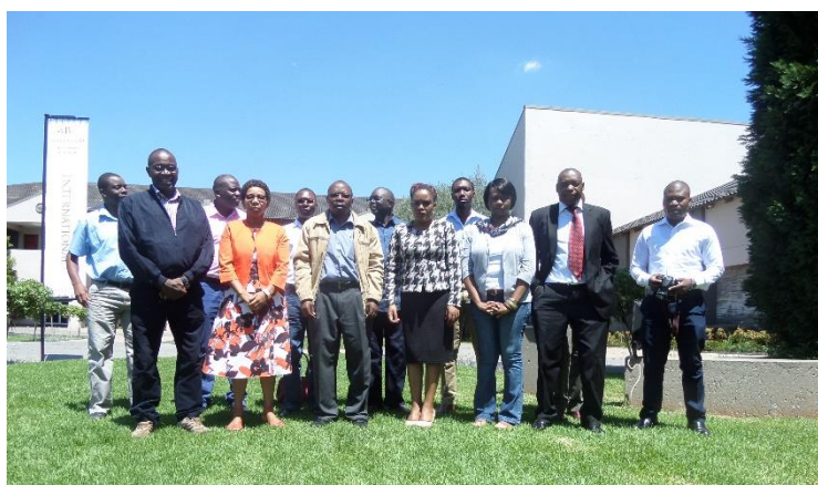
M&E WG members & Communication focal persons at meeting in Johannesburg

In an effort to improve the quality of reporting by R&D scientists, the M&E working group reviewed the template for reporting on R&D projects to ensure that all the relevant data required for updating the national results frameworks and that technical information being generated by the projects would be properly captured. Following this exercise, the M&E teams conducted workshops for scientists to create awareness on the revised indicators, regional result framework, reporting template and other M&E related topics.