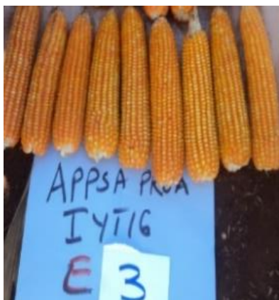
Some promising Pro Vitamin A hybrids IYT16