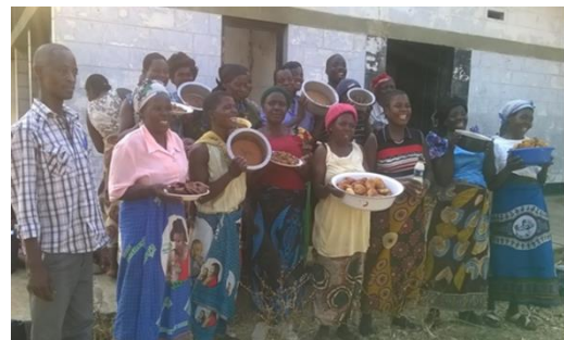
Farmers showcasing soybean products in Malawi