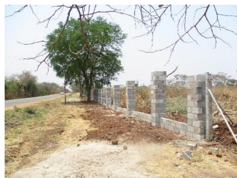
Wall fence construction at Mt Makulu Research Station in Zambia.