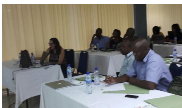
Food Legumes group in Nampula, Mozambique

While some progress was made in meeting the expected outputs of the meetings; the final sets of R&D documents were still not submitted by 31 December 2016. For the