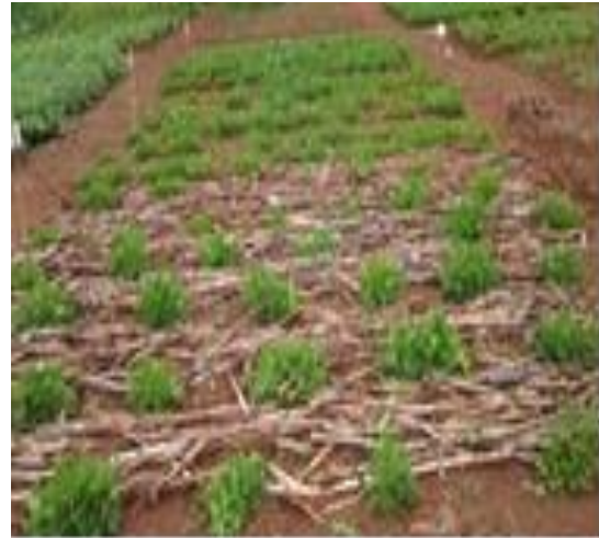
ICM technologies: Planting in rows and mulching in Groundnuts