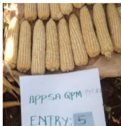
Some promising QPM PYT Entries