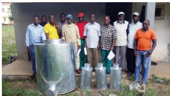
Artisan Training in Chokwe, Mozambique