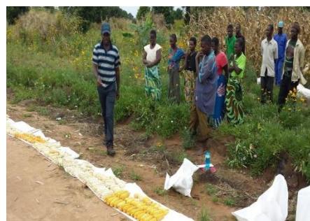
Participatory selection of maize varieties tolerant to striga in Malawi