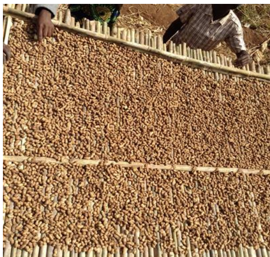
Raised ventilated platform