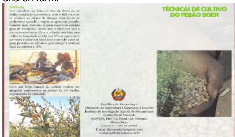
Pigeon pea production guide in Portuguese