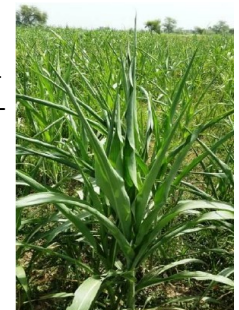
Figure 4 The leaves of sorghum roll under high temperature conditions in order to prevent water loss due to high transpiration rate

The broad leaves of sorghum are important for maximizing photosynthetic capacity of the plant, however the leaf roll trait is very important to reduce transpiration rate under incidental high temperature conditions.