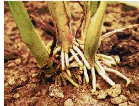
Figure 3 secondary roots of Sorghum

Sorghum varieties with more extensive rooting system characterised by secondary roots have potential to withstand water scarcity more than those without. The secondary roots are finer and grow from the stem basal nodes. They branch more than the primary roots. They can reach lateral distribution of about 1- 2m. Thus are able to access soil water from the top most layer of the soil immediately after light showers of rain, covering even the inter-row spacing