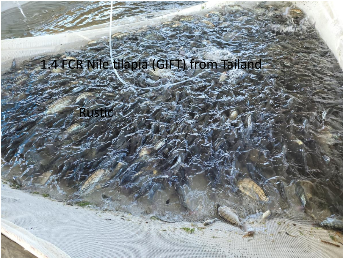
1.4 FCR Nile tilapia (GIFT) from Thailand