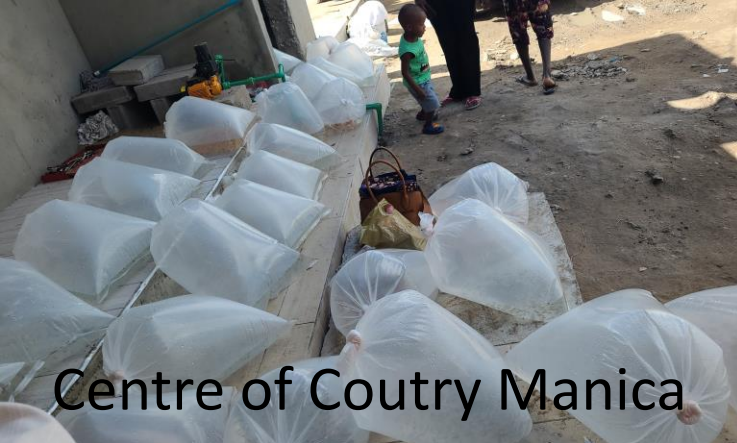
Centre of Coutry Manica