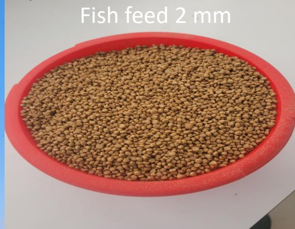
Fish feed 2 mm